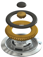
Pictured: ILVE Brass Burner

A stainless steel finish ensures this cook top will co-ordinate beautifully with the design of other ILVE appliances. ILVE have maintained their core values as a family owned business and continue to manufacture appliances that represent the most pure thing in a family – dinner time! The kitchen is, and should always be, a place & a time where the family meets & shares.